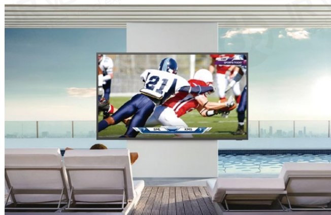
Outdoor LED TV